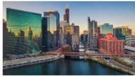
YEA Leadership Weekend 1.0