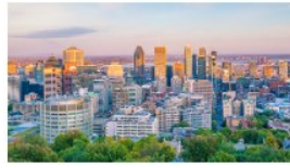
YEA Leadership Weekend 2.0