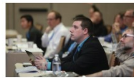
HVAC Design Scholarship