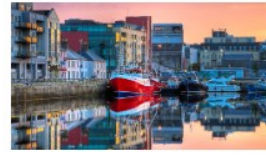
YEA Leadership International