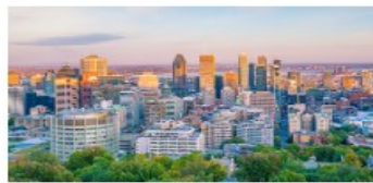
YEA Leadership Weekend 2.0