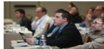
HVAC Design Scholarship