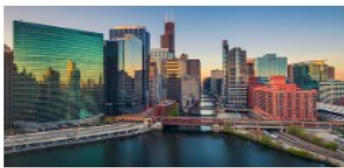
YEA Leadership Weekend 1.0