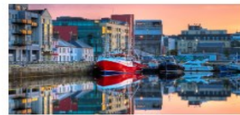
YEA Leadership International